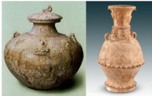
Fig.2 The mldelling changes of celadon

At first, good looks mean aesthetic and sensibility. There is big different in aesthetics between ancient China to modern China. For example, the trend of in Weijin dynasty had great impact on filed of arts and design. While the description of seven sages of the bamboo grove in 'Jinshu' incisively and vividly showed the typical features of 'Show clear phase bone', it became the aesthetic characteristics as well. In 1983, the dish pot dig from Nanjing was produced in the period of three kingdoms. The body of the pot is a very large circle. To the period of Southern dynasties, the neck of pots became higher and the body turned into slim. The whole model converted into the style of slim and high, which left people a feeling of dignified and beautiful and perfectly fit the trend of 'Show clear phase bone'.